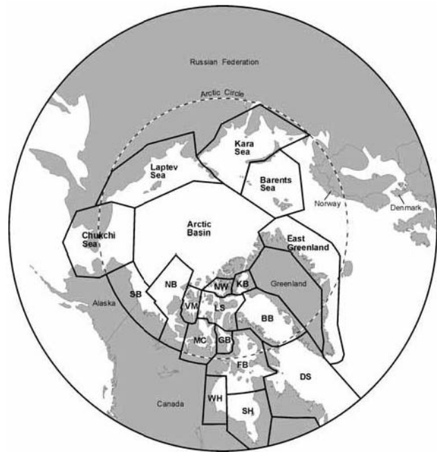
FIGURE 1 DISTRIBUTION OF POLAR BEAR POPULATIONS THROUGHOUT THE CIRCUMPOLAR BASIN